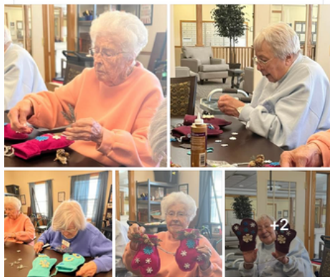
Addington Place highlighting our senior outreach!