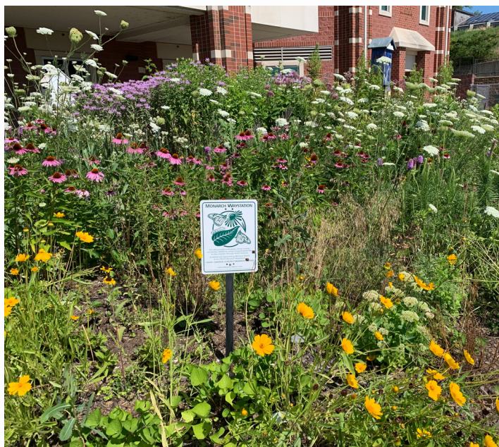
Peggy Ell Pollinator Garden update